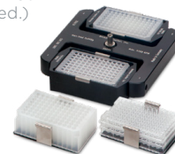
S6096 rotor (Microplates not included.)