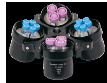
SX4400 rotor (Tubes not included.)