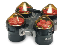
JS-4.750 Rotor (Bucket covers and bottles not included)