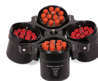
SX4400 rotor (Tubes not included.)